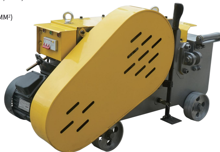
GQ40A STEEL BAR CUTTER